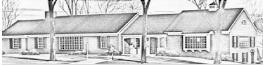
Bicentennial Building, est. 1978